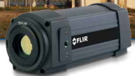
FLIR A310 thermal imaging camera