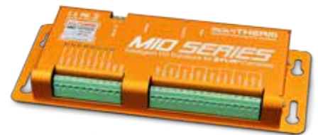
The MoviTHERM MIO (Intelligent I/O) module provides discrete electrical connections needed to generate alarms and warnings based on predefined temperature conditions.