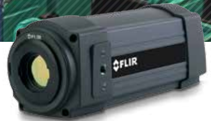
The FLIR A310 produces crisp thermal images of 320 x 240 pixels and detects temperature differences as small as 50 mK.

The system was not designed to replace any existing fire detection and response protocols, because the customer did not want to rely