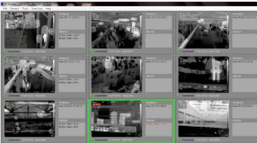
The live camera images are displayed on a video monitor for continuous, real-time viewing by facility personnel.

Specific regions of interest can be defined in each camera scene, so the early warning system can respond to unexpected temperature anomalies.