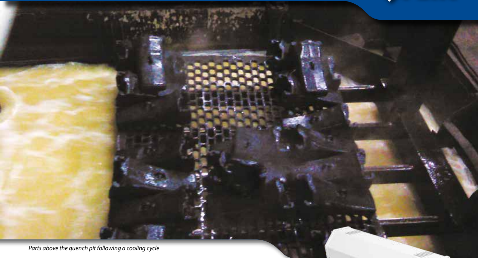
Parts above the quench pit following a cooling cycle