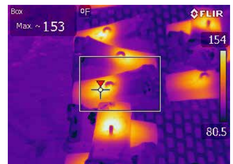
Parts above the quench pit following a cooling cycle