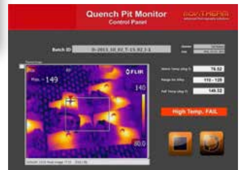
The Quench Pit Monitor HMI panel

MOVITHERM advanced thermography solutions