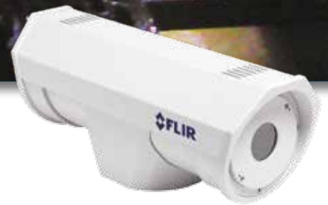
FLIR A310f thermal imaging camera

The parts to be inspected are first heated in a kiln to temperatures approaching 2,000 °F. After heating, the parts are transferred to a liquid cooling chamber or "Quench Pit", for quenching. After some time has elapsed, the parts are removed from