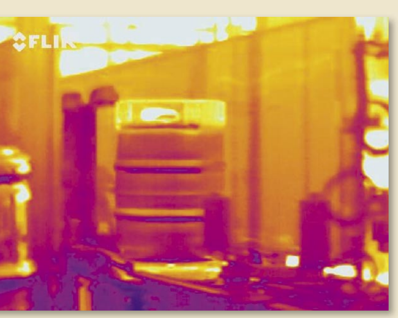
Infrared image of a keg filled with beer.