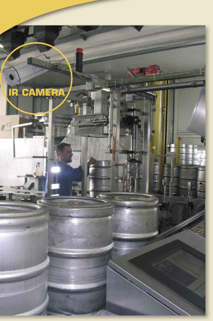
The infrared camera (top left in the image), checks each passing keg.