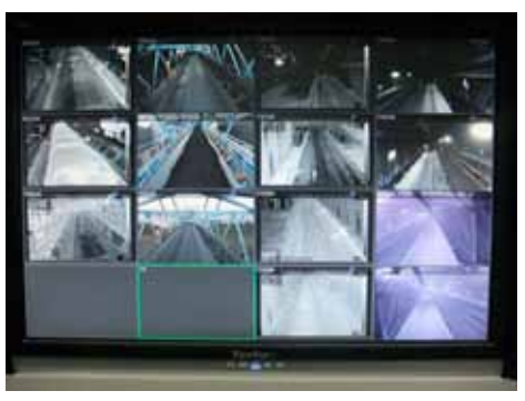
The footage and thermal data from the seven FLIR A310 thermal imaging cameras is sent to the PLC and to the control room.

coal is transported to the boilers at a speed of four meters per second several additional FLIR A310 thermal imaging cameras check the temperature along the way. If at any point the temperature of the coal rises above a previously determined parameter an alarm goes off.