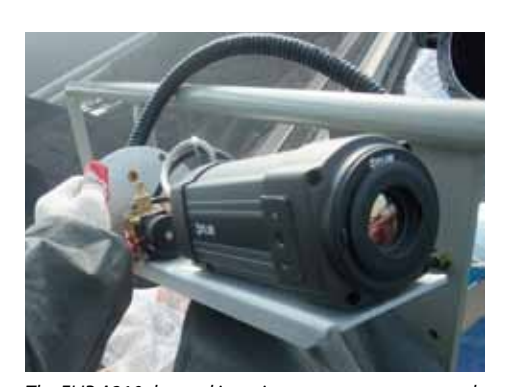
The FLIR A310 thermal imaging cameras are mounted over the conveyor belt in waterproof protective housings.

One FLIR A310 thermal imaging camera is installed at the storage end, checking the coal as it enters the conveyor system. As the