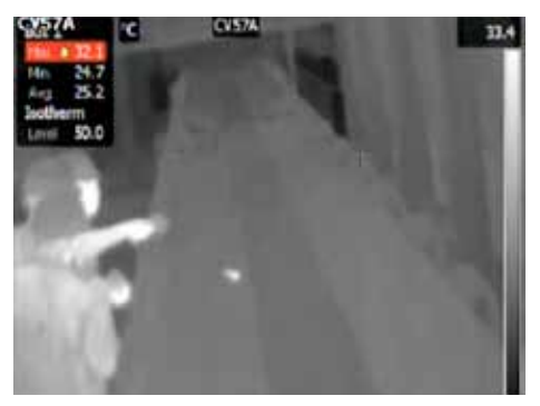
Tests by EWP employees have clearly shown that the thermal imaging early fire warning system is very effective in preventing coal fires.