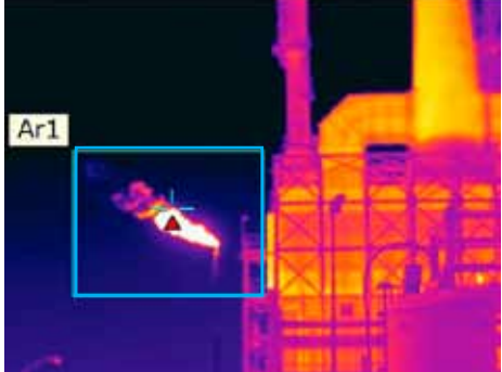
Although invisible to the naked eye a thermal imaging camera can monitor whether a flare is burning or not. If the flare is not burning, harmfull gasses can enter the atmosphere, an alarm can go off and immediate action can be taken.