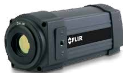
The FLIR A315 thermal imaging camera incorporated in the AIRS system automatically scans the underside of trucks for malfunctioning brakes, overheated bearings and tire risks.

Once the vehicle has passed the camera, the AIRS computer analyzes the captured data and compares the signal patterns with the system's predefined conditions. The computer creates a record of the vehicle, including all of the relevant temperature data and the thermal image of the vehicle. This record is displayed on the AIRS screen, alongside the records of other vehicles that come into the station before and after it. Records are deleted from the system once the truck leaves the station.