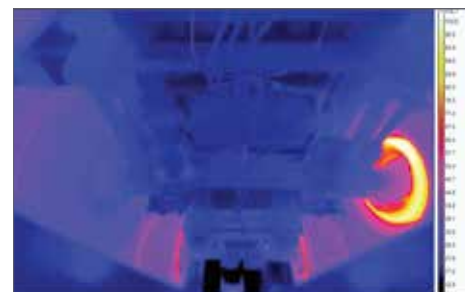
The warm brake on the right seems to function normally. The brake on the left shows up as cold in the thermal image, this indicates that it does not function properly.