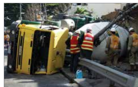
Inoperable brakes are a leading cause of highway traffic accidents in the US.