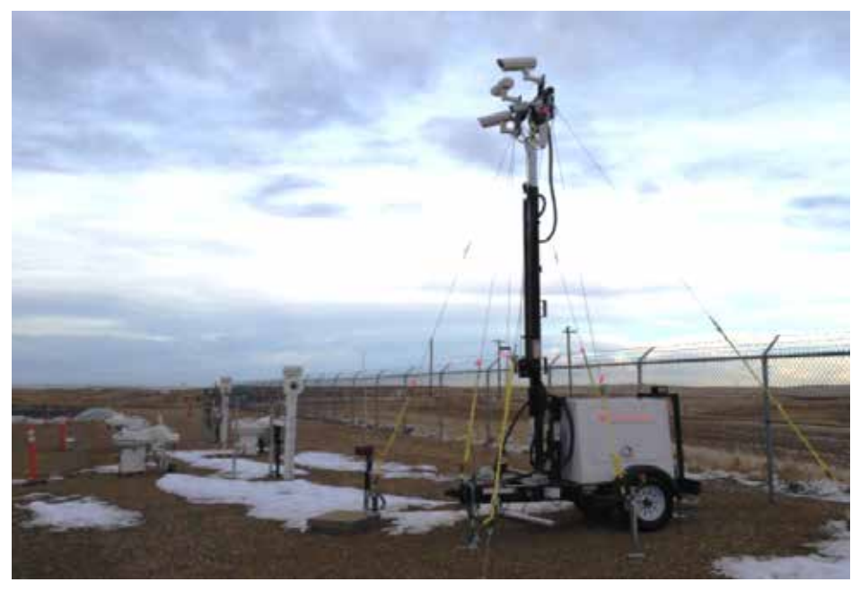
An IntelliView trailer in the field: The weatherproof and self-contained trailer can accommodate multiple DCAM™ units and green power options (fuel cell and solar panels). The DCAM offers an effective way of detecting and alerting on small above-ground fluid spills, sprays and pooling within seconds.

industry however, pipelines are typically monitored by means of regular manned patrols on foot and/or by car. Needless to say that this can be a very costly operation, and is by no means a watertight 24/7 control process. The mining industry is extremely concerned with the environmental impact of a spill and water stewardship in general and has been actively seeking to improve their monitoring methods for years."