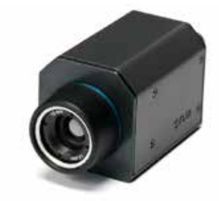
The FLIR A65 produces high-quality thermal images in 640 \times 512 resolution, with temperature differences as small as 50 mK.

"With standard leak detection techniques, such as pressure sensors or mass volume calculations, it is very difficult to detect smallsize liquid leaks very early on, mostly due to the leak size. These standard solutions have a typical accuracy of one to five percent," says Shane Rogers, vice-president Product Development at IntelliView. "In the mining