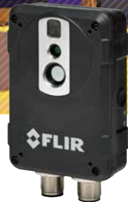
Combining thermal and visual cameras in a small, affordable package, the FLIR AX8 provides continuous temperature monitoring and alarming for critical electrical and mechanical equipment.

To address the growing utilization of MCM for fault detection and predictive maintenance,