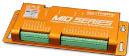
Intelligent I/O Module – MoviTHERM MIO-AX8-7

before they turn into costly and potentially critical equipment failures.