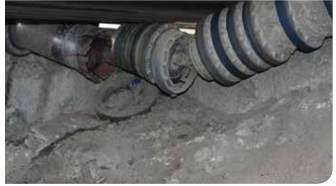
Defective lower support roller of a belt conveyor

(www.inau.de). He suggested trying a permanently installed thermal imaging camera from the FLIR A series. The FLIR A310 was mounted on the bed of an SUV and pointed in about a 45-degree angle to the direction of travel. Among other things, a special housing unit was required to securely mount the FLIR A310. The thermographic camera system can operate without any cable connection, because it includes a battery power supply and a wireless communication unit.