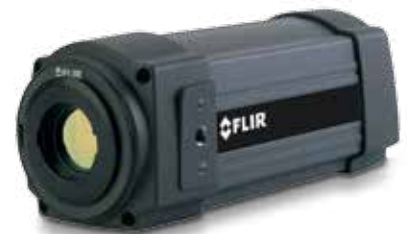
The FLIR A310 thermal imaging camera

That's when MIBRAG turned to Klaus Flocke at the engineering firm Inau