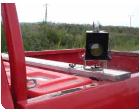
The FLIR A310 was mounted on the pick-up in a special protective housing

Due to the success of the test, the mobile thermographic monitoring solution will be implemented as the new standard at MIBRAG in the areas of mining and strip mining in Profen and Vereinigtes Schleenhain starting in December 2015. But Klaus Flocke from Inau still has some work to do: "Due to the fact that the test was so successful, we are already preparing a test run in the power stations and the dust factory." Klaus Flocke and MIBRAG thus continue their commitment to security - and at FLIR, we are also proud to be able to contribute to this endeavour.