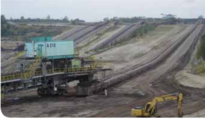
Belt conveyors at the mine in Profen