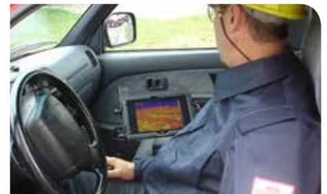
Monitoring with the tablet PC