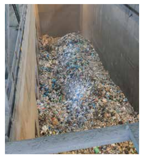
Waste fires are a genuine threat in waste incineration plants and this is also true for ZEVO Malešice.

The incinerator in the Prague district of Malešice has been operational since 1998. The plant, fully named ZEVO Malešice (Equipment for Energy Recovery) takes care of the transformation of waste into thermal and electric energy. The acquired energy is used as heating of domestic water and heating of residential buildings.