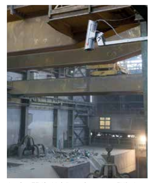
At the ZEVO Malešice plant, two FLIR A615 cameras, installed in a protective housing, monitor the storage tank for hot spots that indicate possible starting fires.

Waste fires are a genuine threat in waste incineration plants and this is also true for ZEVO Malešice. The most common causes of fires at waste incineration plants are spontaneous chemical combustion of waste and hot particles given off by the vehicles that collect the municipal waste. A contributing factor to the risk of fire or devastating explosion is the increased concentration of methane, which is released from the waste during the decay process. In order to reduce the risk of fires, the ZEVO Malešice plant decided to invest in the Waste Bunker Monitor system from Workswell. The main goal of the system is to monitor the plant's waste storage for emerging fires.